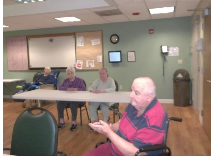
Residents do enjoy the music time!