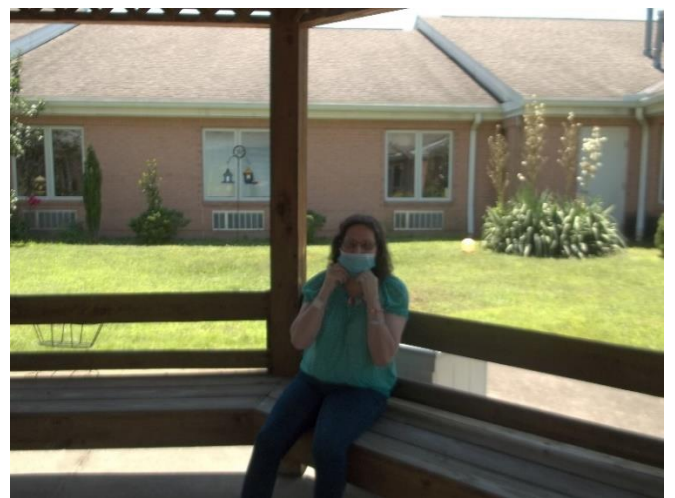
Fresh air is good for the soul! Residents love being outside.