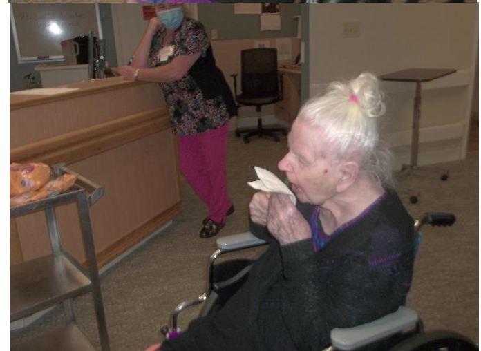
The residents throughly enjoyed the gummi worms!